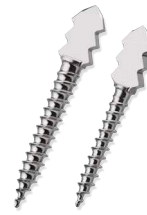
PRO-TOE® VO Hammertoe Implants