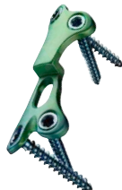
DARCO® TOM Plate