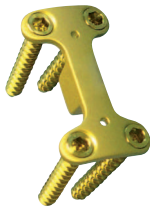
DARCO® PIA Plate